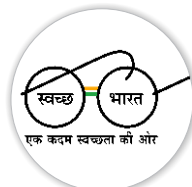
Sawchh Bharat Abhiyan (Govt. of India Initiative)