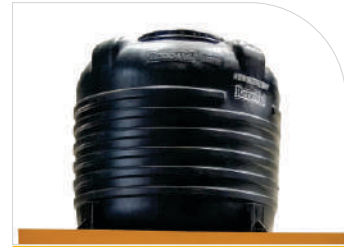
500 ltr. Water Tank